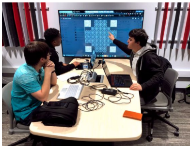
Students working on gaming tech.