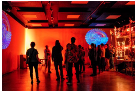
More than music – lighting responds to the music through programming done by the students.