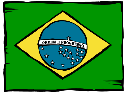
Flag of Brazil