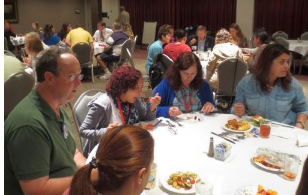
We had a full house at this week's meeting in Old Main.