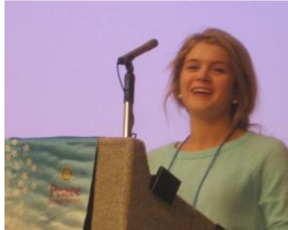
She was radiant in her performance